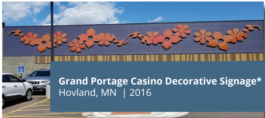
Grand Portage Casino Decorative Signage* Hovland, MN | 2016

CGA Ackley: 739 Park Avenue Ackley, Iowa 50601 Office 641-847-3273 Cell 641-373-3131 jsweeney@cgaconsultants.com