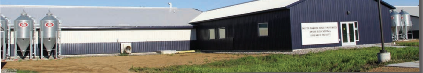
South Dakota State University Swine Research Facility* Brookings, SD | 2015