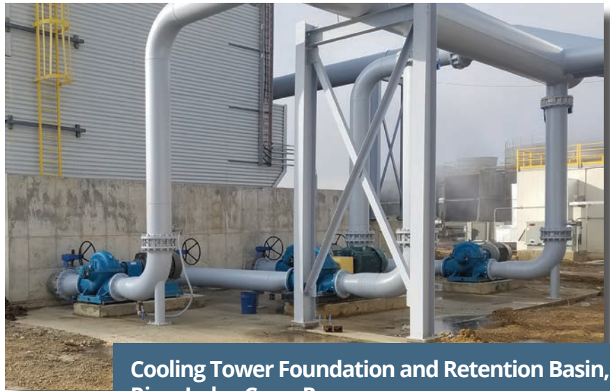
Cooling Tower Foundation and Retention Basin, Pine Lake Corn Processors Steamboat Rock, IA | 2017